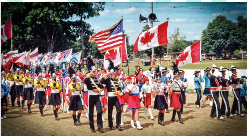
1978: Corps on Retreat in Simcoe

On August 11th, The Offensive Lions were second to Phantom Regiment, but by 14 points. Northstar, of