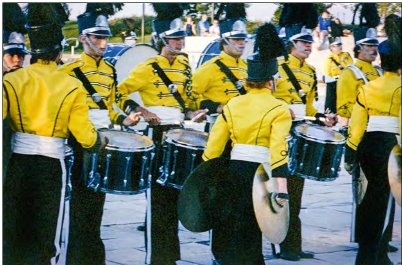
1978: Seneca Optimists Drums

In a field of all-American D.C.I. Corps, the Seneca Optimists were eighth, out of eight. A score of 65.20 was a long way from the first place Madison Scouts, with 86.35. Over 21 points! This was a big disappointment, but not totally unexpected. They had not really got going until May.