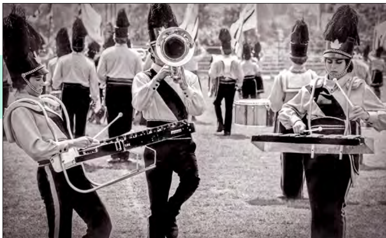
1977: Peterborough Krescendos

A meeting was held at a Holiday Inn, attended by the entire executive of the Krescendos and representatives of the Seneca Optimists. Due to this, the people in the Peterborough Corps knew that something was up, because this was a rare occurrence. Between these two factions, bolstered by the instructors from both Corps, a total of 13 hours of meetings took place. As a result of this a formal agreement was signed, on a Saturday night. It stipulated that final acceptance rested on at least 25 of the members of the Krescendos agreeing to it.