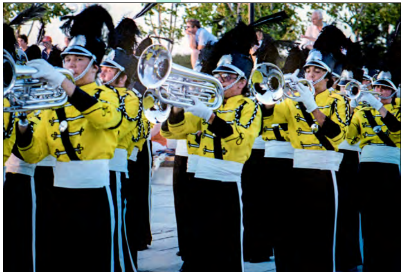
1978: Seneca Optimists Horns