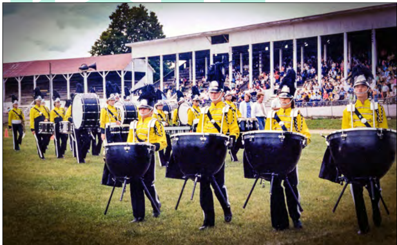
1978: Seneca Optimists in Simcoe

After breakfast, the Seneca Corps went to the practice field, and lo and behold, the Krescendos were already there. A lot of them, lined up and waiting! When the latecomers joined them, the Seneca Optimists, as they all now were, looked huge.