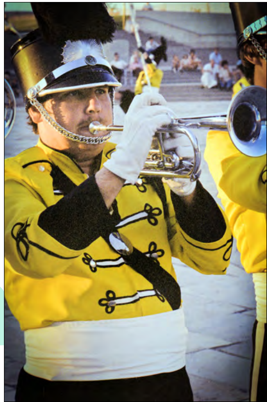
1978: Seneca Optimists

The five day tour, though, was considered a success. A great improvement had taken place between the start of it and the finish. It had served to point out where changes might be necessary. As a result of this, the 1976 number "Farandole" was brought back, and inserted in the second half of the show.