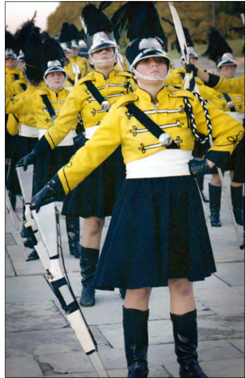
1978: Seneca Optimists Rifle

Further, the writer said that, along with many others, he considered the 1962 Corps the finest Canadian Corps ever fielded. This is saying something after the rise of De