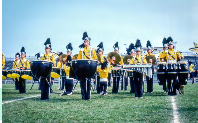
1978: Seneca Optimists

The biggest change, and the one that counted most, was the loss of half of the marching members of the Corps. This sort of thing happens, sooner or later, to many Corps. If a well-trained feeder unit can be used to fill the gap, the effects can be alleviated somewhat. If no such organization exists, then there can be problems. This was the case now.