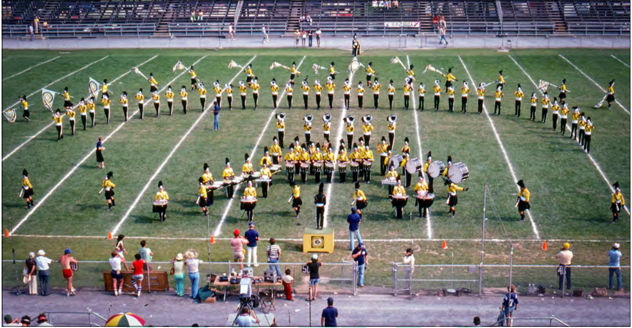
1978: Seneca Optimists