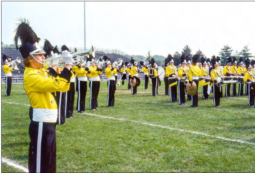
1978: Seneca Optimists

Seneca competed in Sioux City, Iowa, on August 10th, coming 5th with a 69.00. They seemed mired in low placing, with low scores. They had pulled out of the U.S. Open in Marion, Ohio, which they had won last year. If it was to avoid defeat, they were suffering it now.