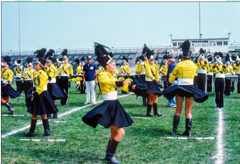
1978: Seneca Optimists

The off-the-line was the most pleasant number this Corps played, by a horn line that had blend and balance. Not size, though. "Puttin' of the Ritz" was, maybe, a bit difficult. It must be realized that, no matter how much the Peterborough people wanted to be D.C.I., not all of them were of that calibre. Some of the Seneca people were not either, so we had a D.C.I. Corps, that entered D.C.I. shows, but without a full complement of D.C.I. calibre people.