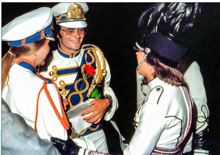
1978: Offensive Lions win Nationals

For the first time in living memory, the Canadian Junior “A” Drum and Bugle Corps Championship was won by a Corps from Quebec. The Offensive Lions, from Jonquiere, Quebec, 500 miles north of Quebec City, were Junior “A” Champions for 1978. They had been creeping up all year, to finally conquer. Being from such a remote area adds lustre to their achievement. They were to be congratulated. Technically, they impressed the most people, with all sections looking and sounding very solid. An impressive, entertaining show capped it off, with a score of 83.3 for first place.